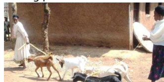
Pict 3: Asset transfer Dec. 10

Livestock 1471 goats and 520 sheep were distributed to 996 beneficiaries. 183 beneficiaries received training. In addition 14 bulls of improved breed entered the project area. 34 cows received service while from the