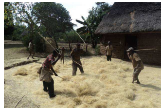
Pict. 1: Improved teff harvest Nov.10

Crop productivity & production The activities on seed multiplication resulted in improved harvests of improved potato seeds, teff and wheat. Farmers returned 120% of the seeds as agreed which will be used for the next rounds. Although the construction of seed banks and DLS are underway, temporary storage was required. 133 beneficiaries participated at the training for seed bank management. Then, the irrigation activities are in progress, the first contractor is selected while the micro credit for rope & washer pump is in designing stage. Finally, beneficiaries (115) linked to check dam - and/or drainage canal construction were trained on construction and maintenance techniques.