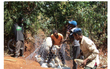
Pict. 2: Practical NRM training

Livestock 1471 goats and 520 sheep were distributed to 996 beneficiaries. 183 beneficiaries received training. In addition 14 bulls of improved breed entered the project area. 34 cows received service while from the